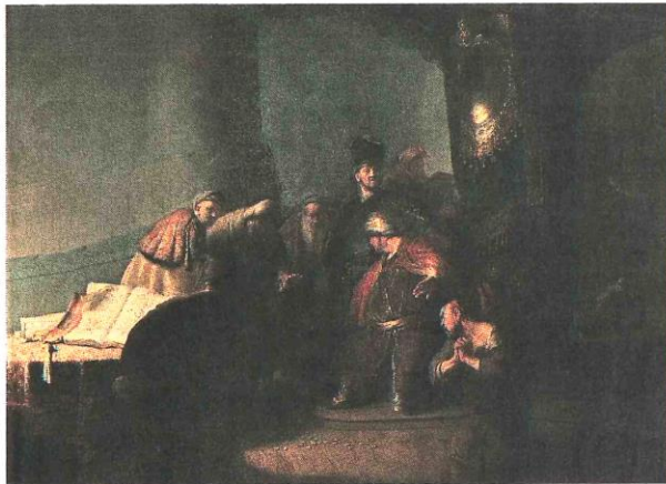
PRIVATE COLLECTION, THE NATIONAL GALLERY, LONDON

Rembrandt's "Judas Returning the Thirty Pieces of Silver" will go on view at the Morgan Library & Museum on June 3.